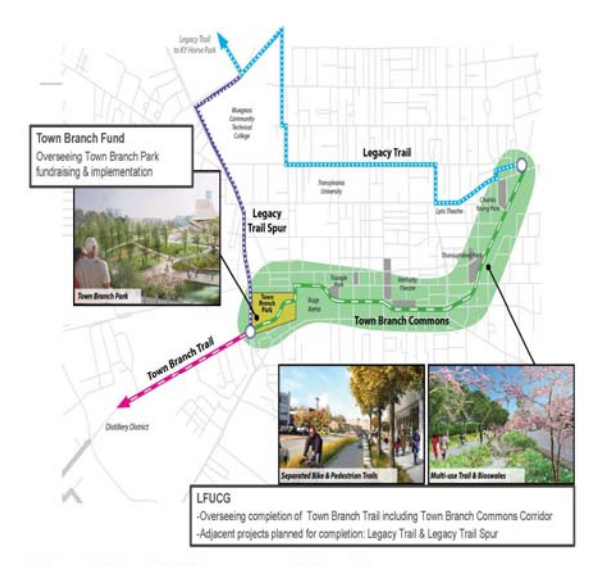
Town Branch Commons Overview