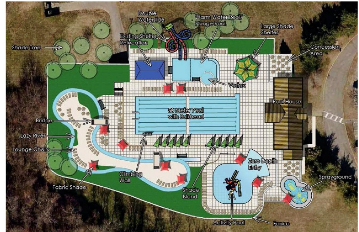
Major enhancements are proposed for Shillito Park's Pool which would transform the facility into a "Regional Aquatic Center."

Clays Mill Road Widening Update. You may still notice some rough spots. The final surface has not been laid. It will be completed this spring when the asphalt plants open. That will take care of the rough spots at the beginning, end and on the